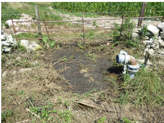
A hole full of slurry!

I am now starting on the lunky. This has been a bit traumatic. I had identified, with Joe, a site where they wanted to put a slurry pumping pipe through to the pump. Dave, from Eucan (conservation group), had kindly strimmed it all for me but when I went up on Tuesday last week to do some preparation I discovered the hole in front of the wall and the foundations were full of slurry where it had been dripping slowly for several days!